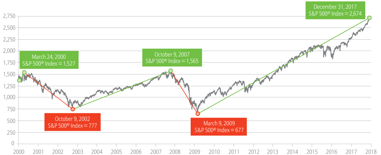
The above time period was chosen as an example to illustrate two complete cycles of recent volatility in the S&P 500® Index from 1/1/2000 to 1/1/2018.

The advantages of a fixed index annuity with annual reset